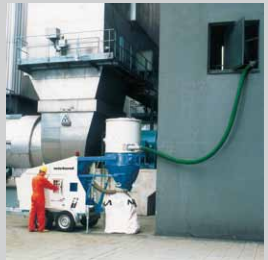
Vacuum cleaning of plant and equipment in a coal fired power plant with VacTrailer S-4