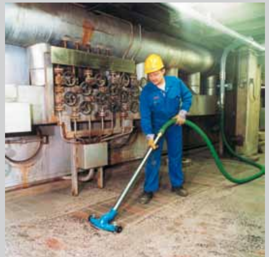
Floor cleaning in the boiler house