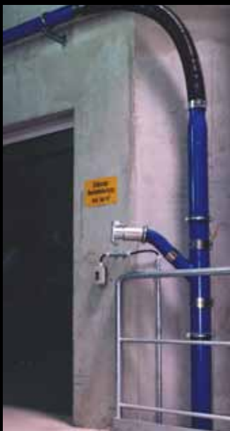
Piping system with suction inlet valve DN 50 (2") for the cleaning of machinery and floors on different levels

The industrial vacuum units are designed ignition-source free. They comply with the ATEX explosion protection standard. Filter systems are available with dust classes M or H according to the respective requirements.