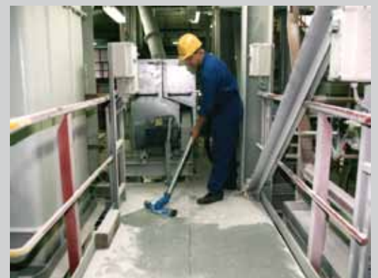
Floor cleaning in the fly ash area